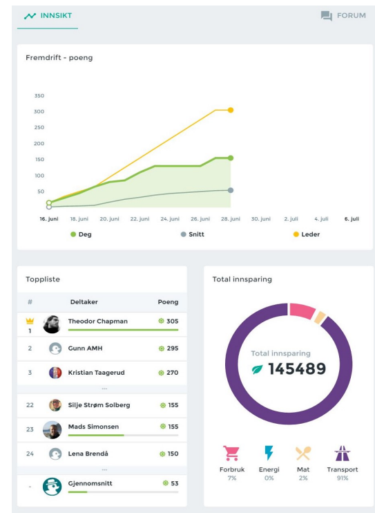
Figure 2 Desktop page for a challenge with individual statistics of the day-to-day progress of a community.

As part of Ducky's overall user-centered design process, the user interface (design and