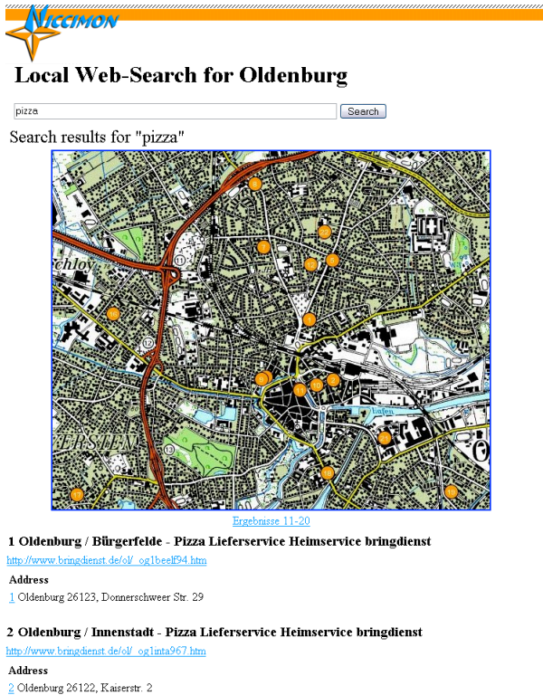
Figure 2. Local search results for Oldenburg

Our first prototype exclusively used query-based seeds for page discovery and directly processed these with our geoparser. It was built as a feasibility study of geo-extraction and –referencing. Using a commercially available geocoder from a related project, extracted addresses were mapped to geographic coordinates.